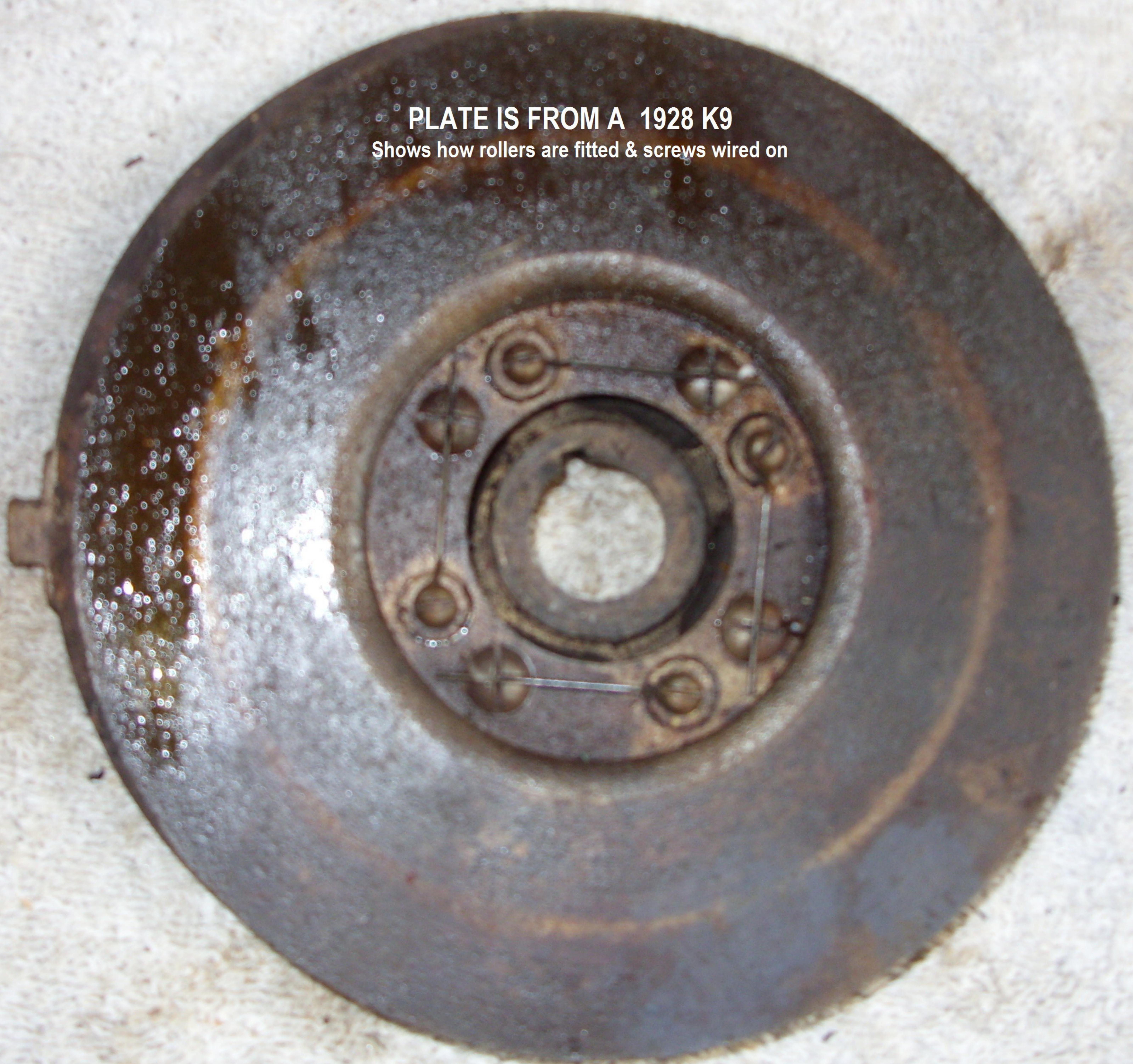
PLATE IS FROM A 1928 K9 Shows how rollers are fitted & screws wired on